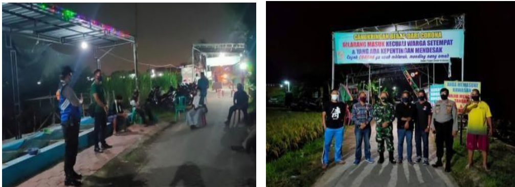
Picture 3. Socialization To Inhabitant Which Involve Figure Religion And Public

The collaboration process was carried out directly by the Head of the Kampung Tangguh Coordinator along with Village chief which then inform directly to society through socialization to residents involving religious and community leaders to provide all information related with the tough village program, as for the portrait as following: