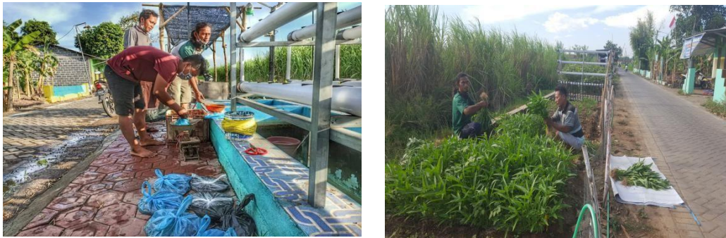
Figure 4. Resilience Food Pool Fish Catfish And Land Vegetables

In mid-May 2020, the resilient village in Cangkringan Hamlet was effectively established walk. Preparation resilience food as effort anticipation scarcity food during pandemic COVID-19, a food barn was built by collecting the rice harvests of local rice farmers local. Besides it's prepared also land marginal to exploit inhabitant to be planted vegetables, fruit, And Also used for the pool cultivation fish catfish. As for his portrait as following: