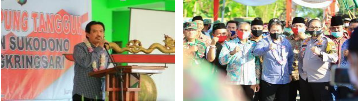
Figure 2. Resilient Village Launch In Cangkringan Hamlet Which Was Inaugurated By Acting Regent Sidoarjo (Alm. Nur Ahmad)

district area Sukodono. Location launching is at in Village Tough Cangkringan Hamlet.